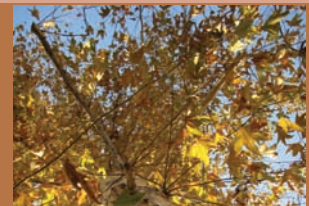
Reaching New Heights

Residual Bequest: A gift of all or a portion of the remainder of the estate after other obligations or bequests have been distributed. "I give, bequeath, and devise (all, or state % or shares) of the rest, residue, and remainder of property, both real and personal, wherever situated, which I may own or be entitled to at my death, to Therapeutic Living Centers for the Blind, a qualified 501 (c) (3) charitable institution, located in Reseda, California, to be used for its general purposes."