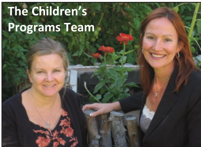
The Children's Programs Team

DD: The most difficult task ahead will be starting a program when budgets in public health and education are being cut at many levels. The constraints of tightened budgets put increased stress on families with infants and toddlers with disabilities. Coordinating services will be challenging for our staff but we